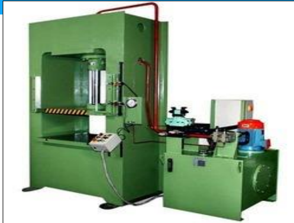
➤ Hydraulic Pressing Machine