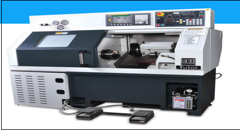
➤ CNC Lathe machine