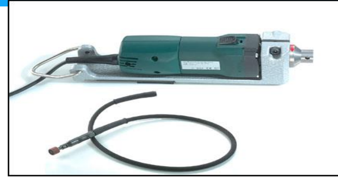
➤ Flexible shaft power tools